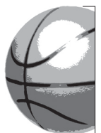
Basketball 9¾ inches

Designed small and soft for easy throwing and catching, a handball is paneled like a soccer ball with a leather shell. A regulation men's ball is 7¼ to 7½ inches in diameter and weighs about a pound, and a women's ball is 6¾ to 7 inches and a little less than a pound.