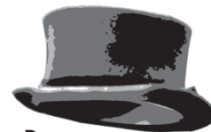
Dressage top hat

In the jumping events, riders are required to wear a helmet with a latched chin strap. But in the detail-oriented dressage competitions, competitors wear formal coats with tails and a top hat.